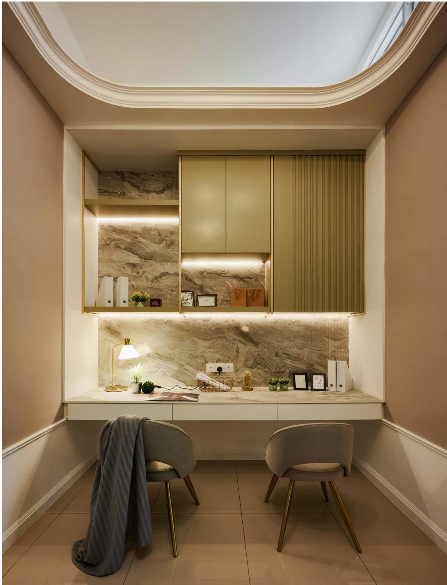
14 / SPECIAL PROJECT